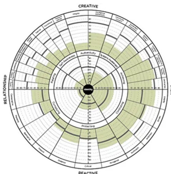
Figure 2 - Leadership Circle

The Leadership Circle Profile (LCP) is a single tool that measures two main domains of leadership: creative skills and reactive tendencies. The first are the researched competencies that measure how the professional achieves the results, elevates the best, leads with vision, improves their own development, acts with integrity and courage and improves the organization's systems. The second relate to leadership styles that privilege care over results-giving, self-preservation over productive involvement, and aggression over alignment-building. Leadership circles are a type of professional learning community that is focused on building specific skill sets while also supporting other leaders facing the same challenges. A group of small to medium-sized leaders meets monthly to discuss a specific topic. Each circle has a different focus and is moderated by one or more participants (Chang & Ko, 2014).